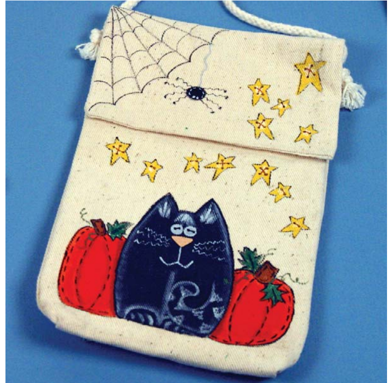
"Along Came a Spider" Pleated Purse