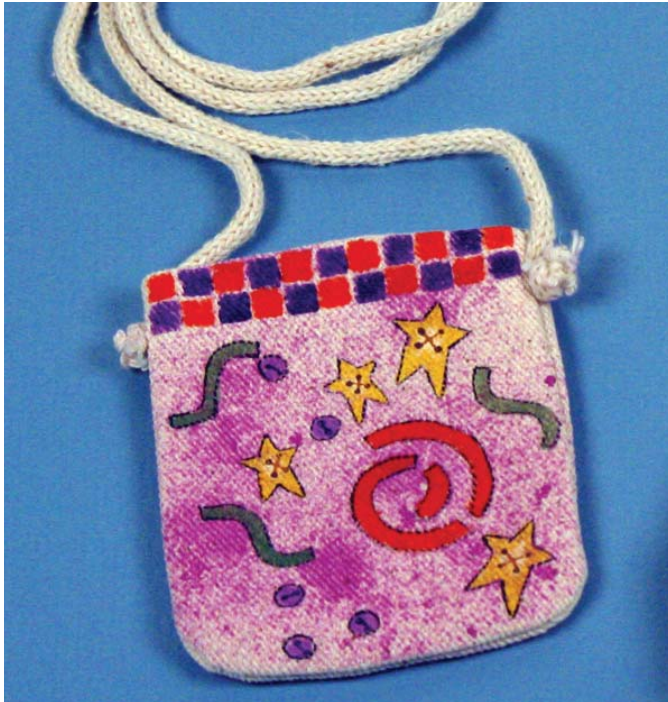
Swirls & Stars Pouch